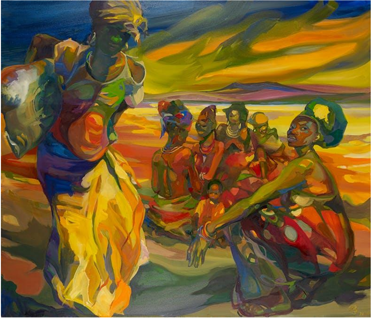
African Vision (1998), Ruth Baumgarte. © Kunststiftung Ruth Baumgarte