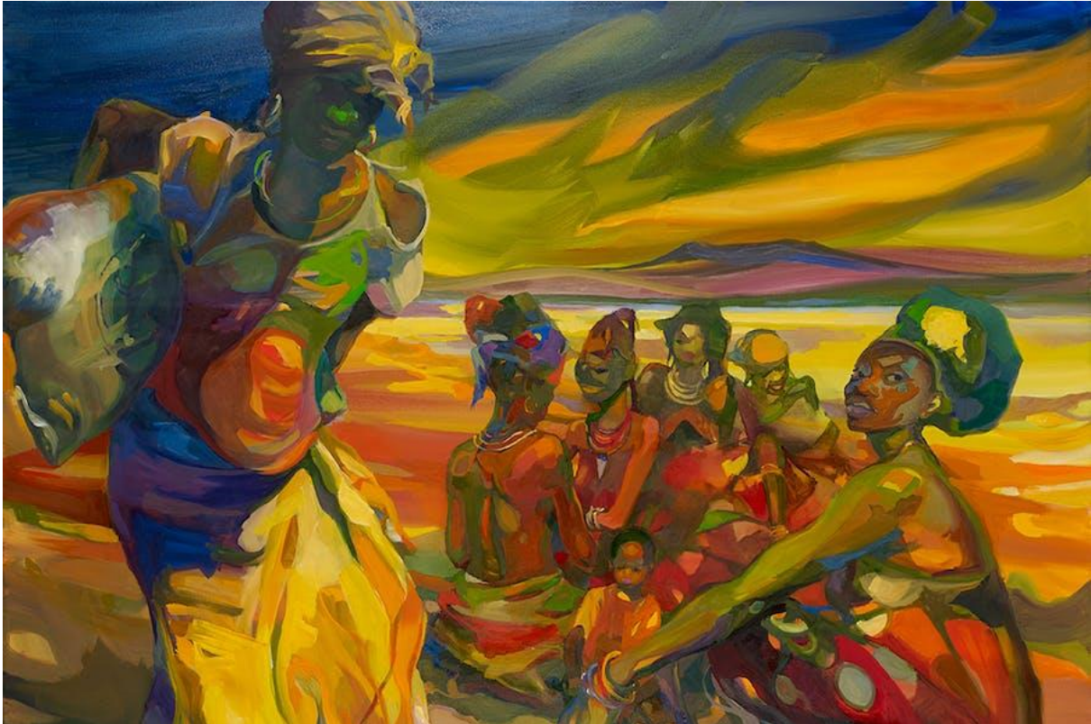
African Vision (detail; 1998), Ruth Baumgarte.

Beginning in the 1950s and continuing until her death in 2013, the German painter made more than 40 trips to the continent of Africa. This display at the Albertina in Vienna (until 5 March 2023) brings together 38 oil paintings, watercolours and drawings, revealing Baumgarte's deep connection to the landscapes and people she encountered. Renowned for her bold use of colour, Baumgarte sought to represent the African landscape with a saturated palette of reds, yellows and oranges. Her works range from dreamlike scenes such as African Vision (1998), to street scenes which, like Misunderstanding (1993), show how the artist sought to capture fleeting moments in sketches, which she later worked up in her studio in Germany. Baumgarte's paintings often blur the boundaries between human forms and the landscapes in which they find themselves – an exploration of humanity's connection with the natural world. Find out more on the Albertina's website.